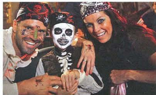
The Pirates League Call 407-WDW-CREW (939-2739)

Wishes™ The biggest, most dazzling fireworks spectacular ever to grace the Magic Kingdom® skies. And you can see it throughout the entire Park!