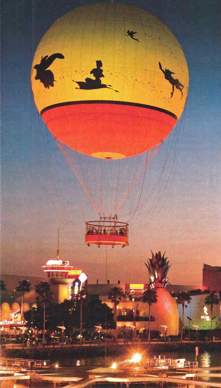
PHOTOS: CAMIRAND, VÉRONIQUE MAL COSTUMES, DOMINIQUE LEMIEUX © 2004, 2010 CIRQUE DU SOLEIL

Marketplace • Pleasure Island • West Side